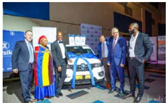
Department of Basic Education's National Teachers Awards

To these ends, we embrace social development, not because we are compelled to, rather because we are driven by a desire to make a difference.