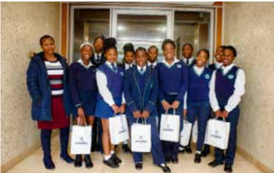
Tsosoloso Ya Africa High School - Take a Girl Child to Work Day