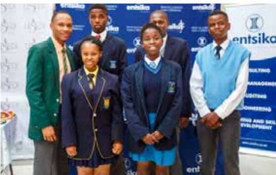
Annual National Senior Certificate Matric Announcements Top Achievers

“ And this stone that I have set up as a pillar will be God’s house, and of all that you give me I will give you a tenth. ”