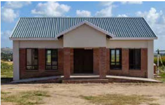
Mtunzini Early Childhood Development Centre