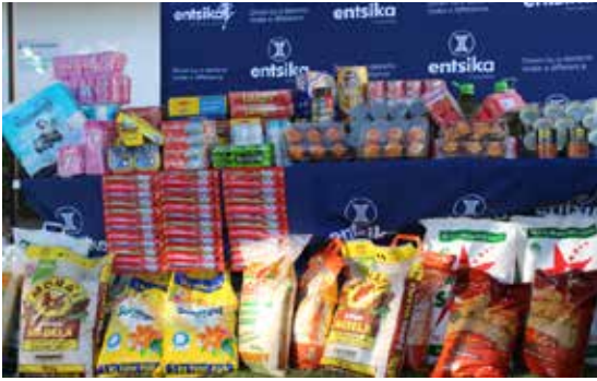
Mirriam Makeba Centre for Girls food drive